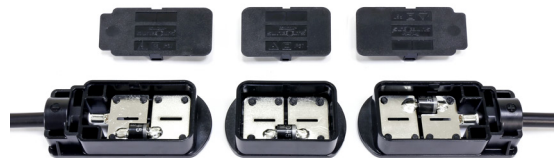
Split Junction Box for Bifacial Module