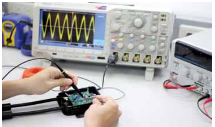
BizLink's professional engineering team is your partner to success.

BizLink is an US-based interconnect solutions provider with factories located in China, Malaysia, and Mexico, engineering support in US, Ireland, Japan and Taiwan. Our factories are committed to comply with RoHS and certified to ISO9001, ISO14001, ISO13485, TS16949 (QS9000), UL and CSA.