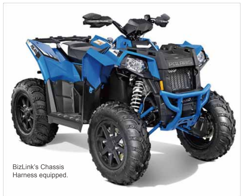
BizLink's Chassis Harness equipped.